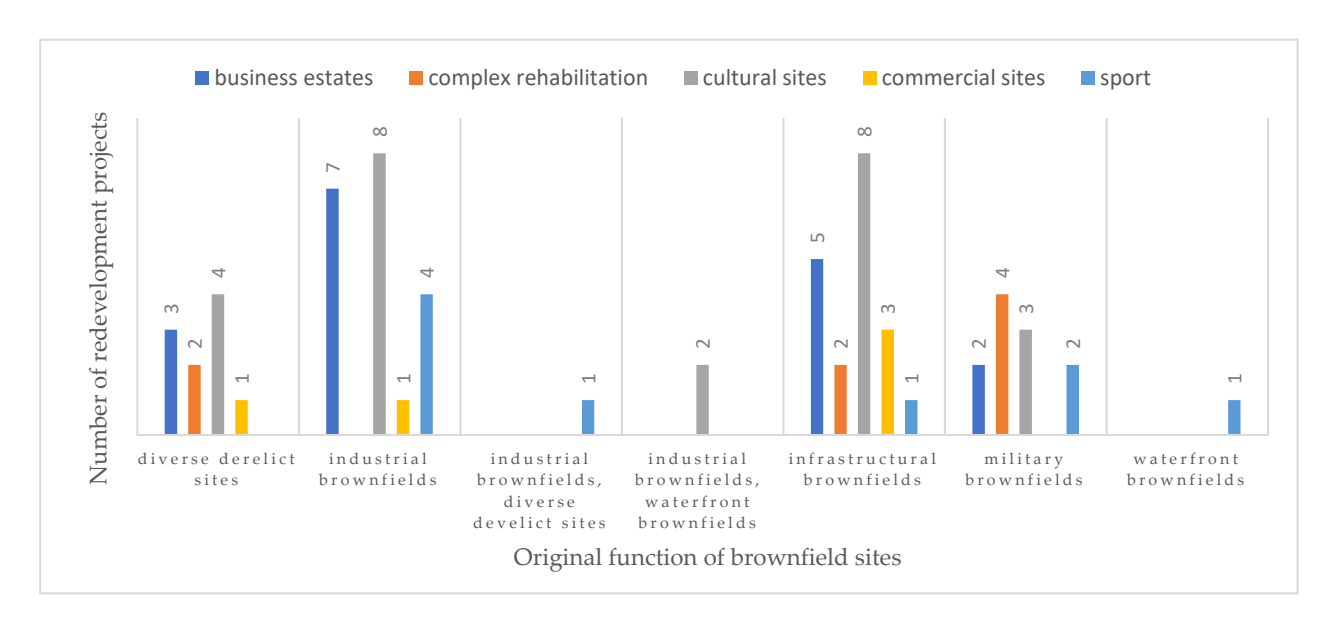
Figure 1. Total redevelopment projects with new functions per original functions (N = 64).

The budget allocated for cultural redevelopment projects is dominant too, it counts for 40% of the specific call for brownfield redevelopments.